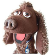
FROM SPARKLES THE WATER SPANIEL

Direct downspouts into rain barrels, yard, or garden instead of the sewer or driveway.